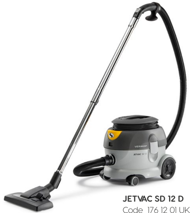
JETVAC SD 12 D Code 176 12 01 UK

This efficient SD 12 vacuum already includes a HEPA 13 filter and is compatible with our VERMOP Software solution for intelligent cleaning. The JETVAC SD 12 D does not stand out characterized only by its excellent suction power, but also broadcasts - thanks to digital networking - the movement data in real time to an existing EGGSTACY Infotainer. The data thus gives information about all procedures in the cleaning process and can be conveniently viewed and analysed in the web portal. This not only optimizes the cleaning processes, but also offers security through a perfect process documentation.