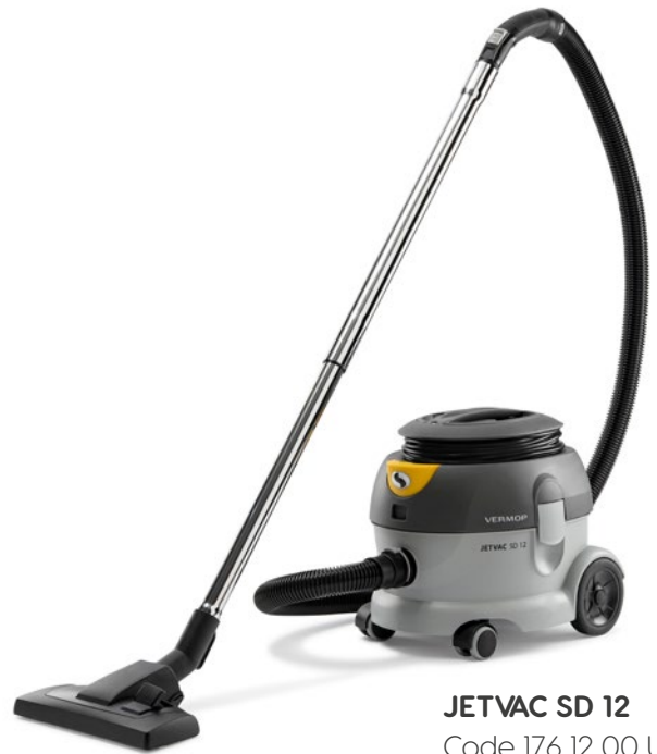
JETVAC SD 12 Code 176 12 00 UK

With 700 watts of input power and a 6-fold filter system, our JETVAC SD 12 generates a vacuum of 22 kPa and ensures consistently excellent suction power even with a well-filled dust bag. Two rubber wheels and two castors ensure smooth running and enormous manoeuvrability. The low center of gravity of the vacuum cleaner also makes it very stable.