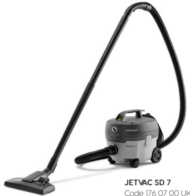
JETVAC SD 7 Code 176 07 00 UK

With an input power of 850 watts, the compact vacuum cleaner generates an impressive vacuum of 23 kPa and still works quietly at 63 dB(A). Two fixed and two swivel castors ensure good tracking properties. A peripheral edge on the impact-resistant container also protects the inventory.