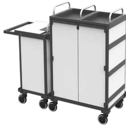
EQUIPE Hotel H1 detachable in „Platinum White“ Art.No. 16668306

The Equipe Hotel's modular design means that you can adapt the trolley to your own individual requirements. Here are just a few examples for different cleaning jobs.