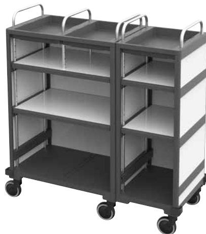
EQUIPE Hotel big „Platinum White“ Art.No. 16668406