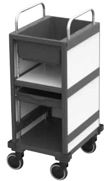
EQUIPE Minibar small „Platinum White“ Art.No. 16668906