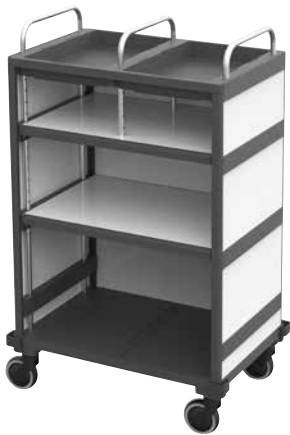
EQUIPE Hotel H3 „Platinum White“ Art.No. 16668106