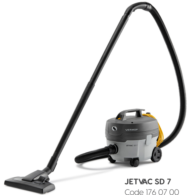
JETVAC SD 7 Code 176 07 00

With an input power of 850 watts, the compact vacuum cleaner generates an impressive vacuum of 23 kPa and still works quietly at 63 dB(A). Two fixed and two swivel castors ensure good tracking properties. A peripheral edge on the impact-resistant container also protects the inventory.