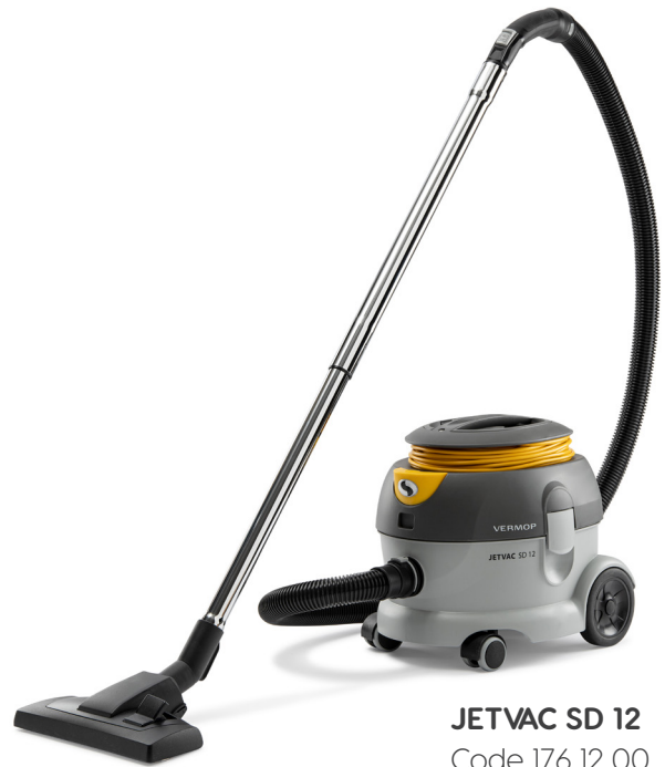
JETVAC SD 12 Code 176 12 00

With 700 watts of input power and a 6-fold filter system, our JETVAC SD 12 generates a vacuum of 22 kPa and ensures consistently excellent suction power even with a well-filled dust bag. Two rubber wheels and two castors ensure smooth running and enormous manoeuvrability. The low center of gravity of the vacuum cleaner also makes it very stable.