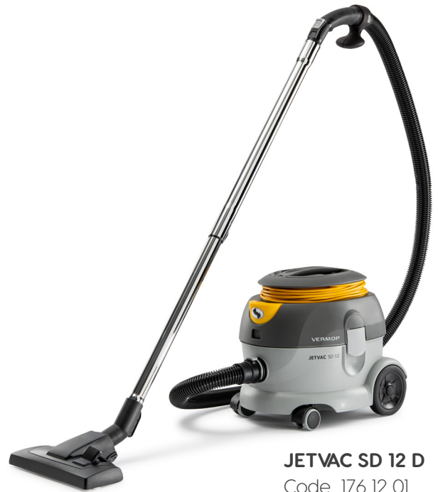
JETVAC SD 12 D Code 176 12 01

This efficient SD 12 vacuum already includes a HEPA 13 filter and is compatible with our VERMOP Software solution for intelligent cleaning. The JETVAC SD 12 D does not stand out characterized only by its excellent suction power, but also broadcasts - thanks to digital networking - the movement data in real time to an existing EGGSTACY Infotainer. The data thus gives information about all procedures in the cleaning process and can be conveniently viewed and analysed in the web portal. This not only optimizes the cleaning processes, but also offers security through a perfect process documentation.