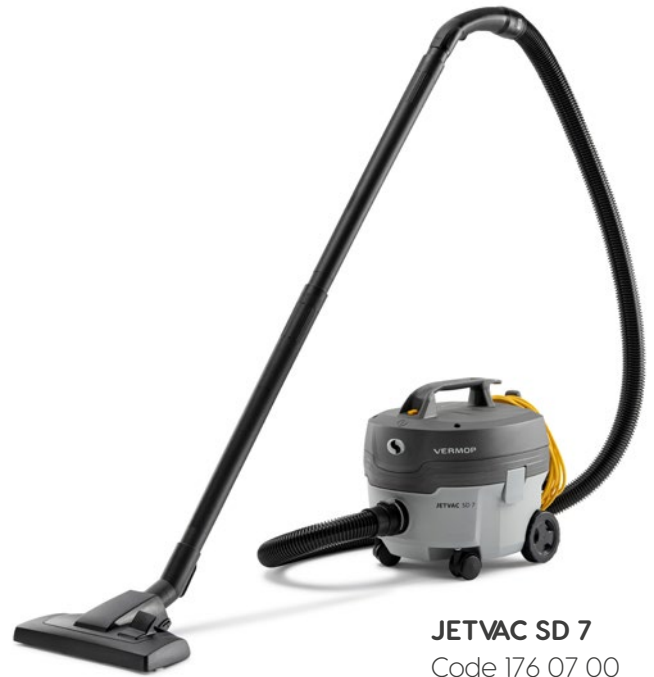
JETVAC SD 7 Code 176 07 00

With an input power of 850 watts, the compact vacuum cleaner generates an impressive vacuum of 23 kPa and still works quietly at 63 dB(A). Two fixed and two swivel castors ensure good tracking properties. A peripheral edge on the impact-resistant container also protects the inventory.