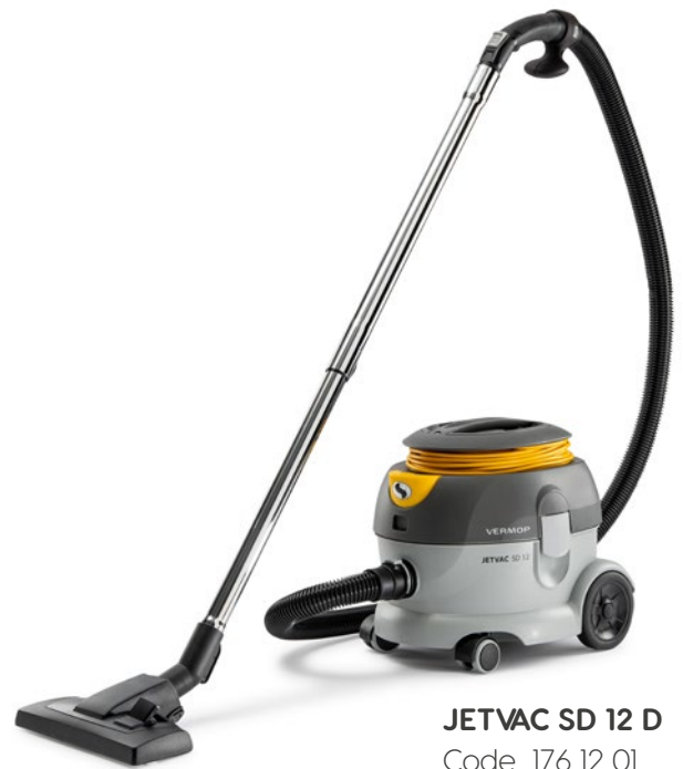
JETVAC SD 12 D Code 176 12 01

This efficient SD 12 vacuum already includes a HEPA 13 filter and is compatible with our VERMOP Software solution for intelligent cleaning. The JETVAC SD 12 D does not stand out characterized only by its excellent suction power, but also broadcasts - thanks to digital networking - the movement data in real time to an existing EGGSTACY Infotainer. The data thus gives information about all procedures in the cleaning process and can be conveniently viewed and analysed in the web portal. This not only optimizes the cleaning processes, but also offers security through a perfect process documentation.