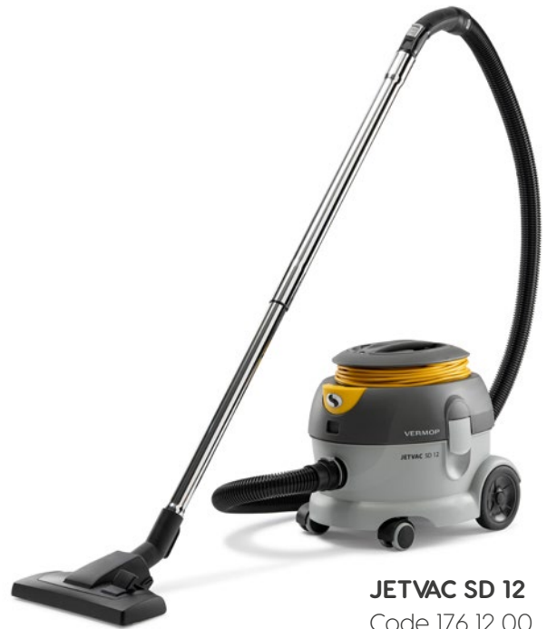
JETVAC SD 12 Code 176 12 00

With 700 watts of input power and a 6-fold filter system, our JETVAC SD 12 generates a vacuum of 22 kPa and ensures consistently excellent suction power even with a well-filled dust bag. Two rubber wheels and two castors ensure smooth running and enormous manoeuvrability. The low center of gravity of the vacuum cleaner also makes it very stable.